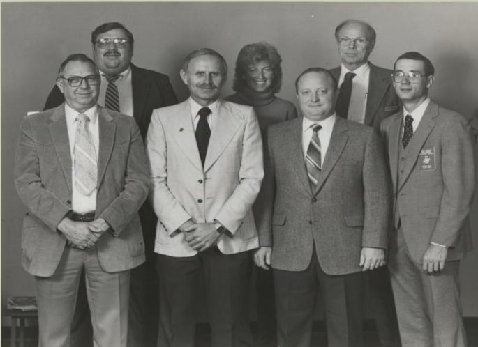
Original NEIAI Board Members

In honor of the 30 th year of the NEIAI here is a look back to where it all started.