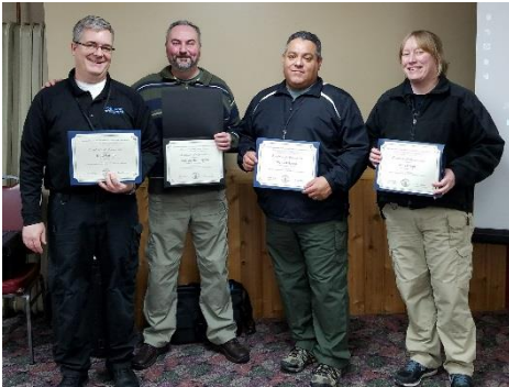
Instructors of the Leica 3D Crime Scene Mapping/Imaging Workshop