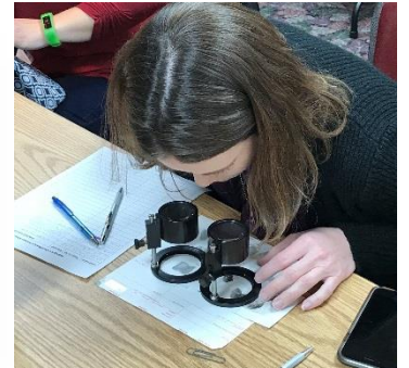
Practical during the Simultaneous Impressions workshop