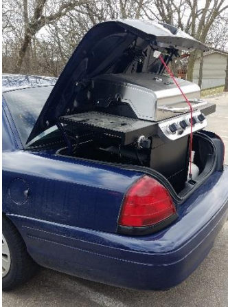
Clever transportation of the grill for the President's Reception