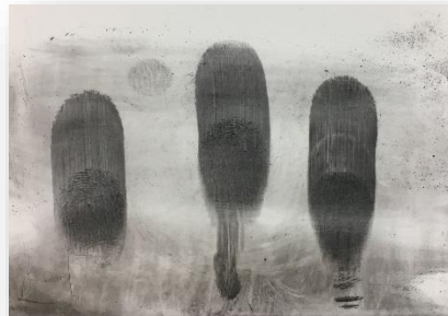
Example of a NON-Simultaneous impression that workshop attendees created to demonstrate the difference between simultaneous and non-simultaneous impressions