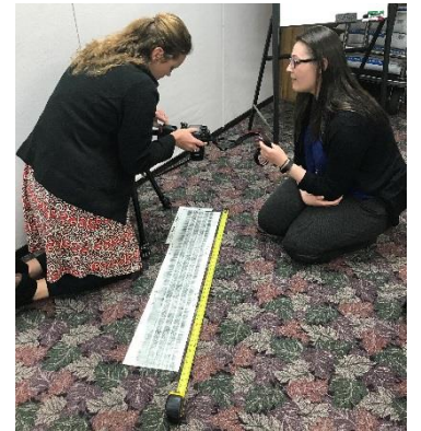
Attendees applying concepts/techniques learned