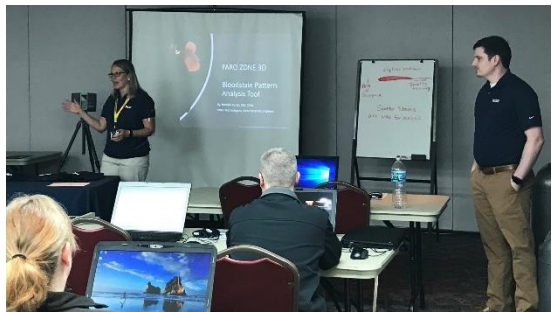
FARRO Zone 3D workshop